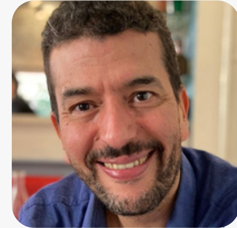
Head of Hepatic Oncology Unit AP-HP, Hospital Beaujon