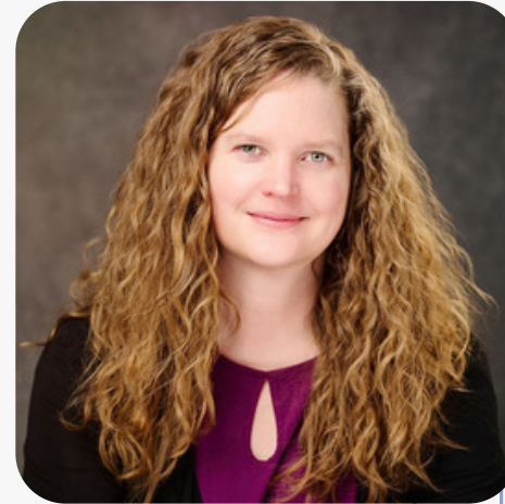
Senior Investigator National Cancer Institute, NIH