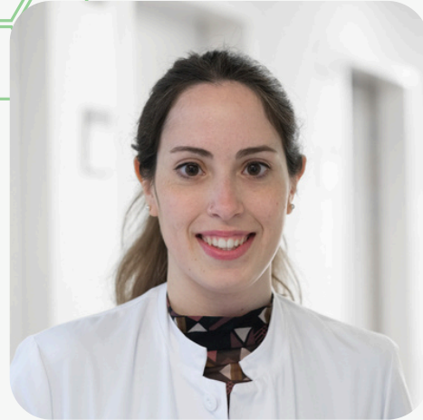
Resident Doctor Essen University Hospital